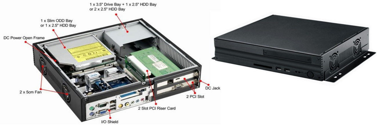
Illustration 1: DS 400 inside and outside view<sup>1</sup>

The configuration of the digital signage computer depends on the specific use case of each project. The following two are our standard products that meet most common needs. We can also perform an on-site evaluation of the customer needs, and provide customised computers as per the requirements identified.