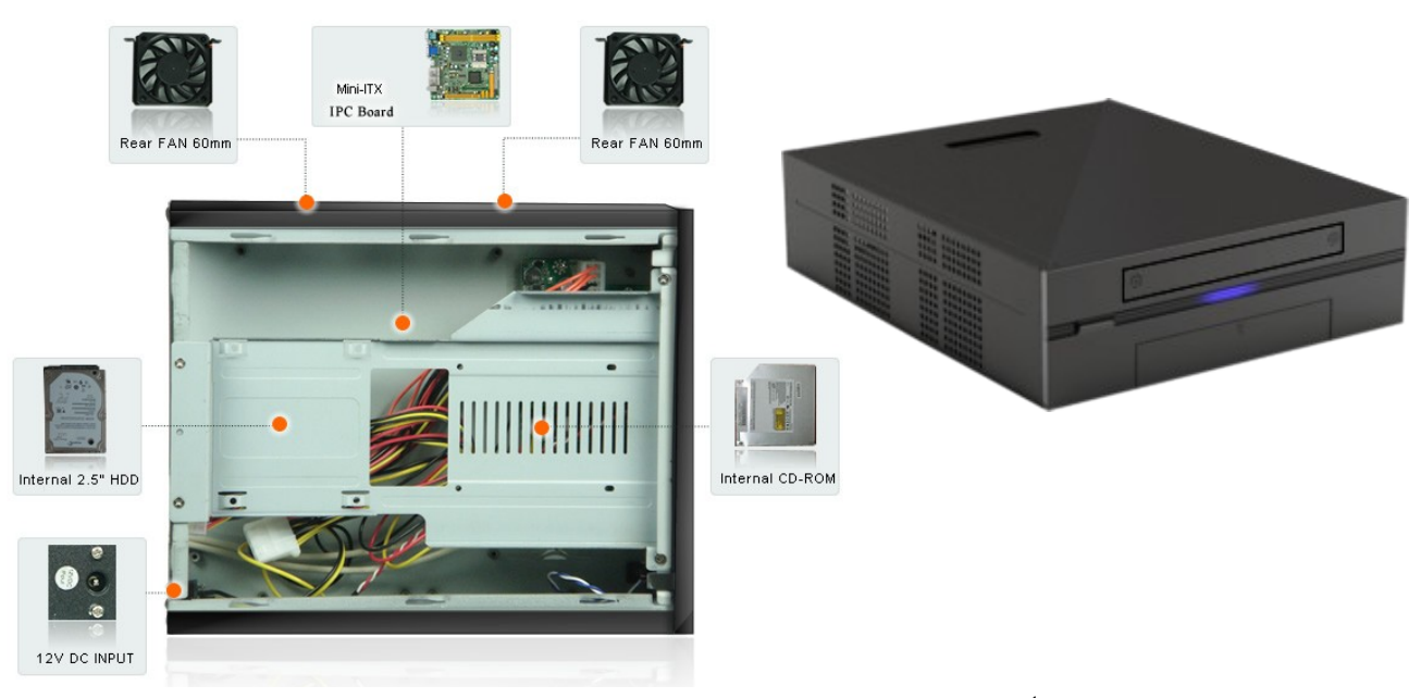
Illustration 2: DS 300 system overview and outside view<sup>1</sup>